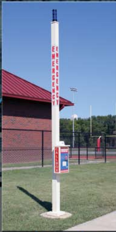
AC Surface Mount Stanchion