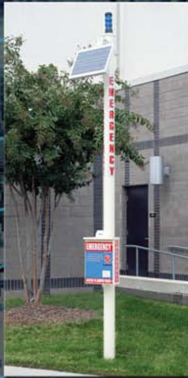
Solar Direct Burial Stanchion