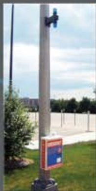
Existing Light Pole

The versatile applications of the CALL24 S-Series Callbox makes it the most affordable and reliable security protection on the market today.