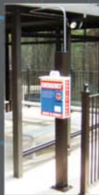
Bus Stop Pole