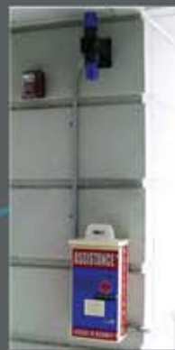
Parking Deck Column